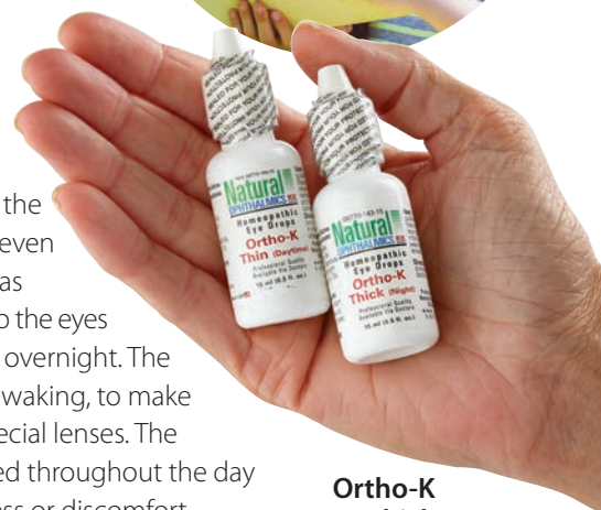
Ortho-K Thick and Thin Drops