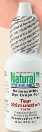
Tear Stimulation Forte Dry Eye Drops

“Dry eye is a main reason why some people stop wearing contact lenses. There are so many causes for dry eye, and there can be different issues with the three separate layers of the tear film. Many patients don’t realize that they have dry eye until they have started on a dry eye regimen and feel the relief. For many patients, I’ll recommend Natural Ophthalmics homeopathic line of dry eye drops. I personally use the Ortho-K Thin [day-time] Drops, which I think are the greatest drops for contact lens wearers.”