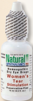
Women's Tear Stimulation Dry Eye Drops