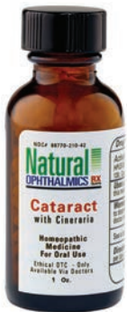
Cataract Eye Drops and Pellets with Cineraria and Eyebright